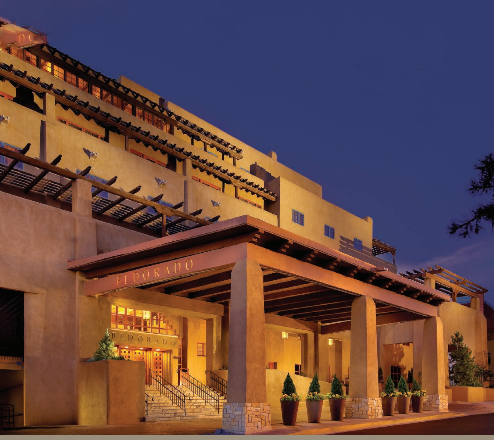
A Heritage Hotels & Resorts Property